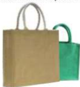
SQUARE JUTE SHOPPERS

Fabric : Jute - Laminated / Unlaminated / Lined - Natural / Dyed Handle Size : Long 70cm / Short 40cm Handle Type : Self / Padded / Tape / Rope / Cane Colour : Natural / Dyed OR 2 Tone