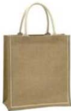
JUTE BAG WITH PIPING