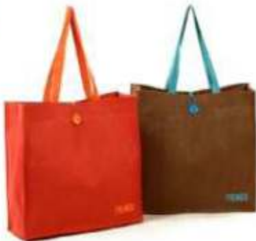
JUTE BAG WITH BUTTON CLOSURE