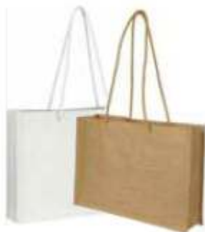
WIDE JUTE SHOPPERS

Large : 45 w + 15 sides x 36h Cms. Medium : 36 w + 12 sides x 30 h Cms.