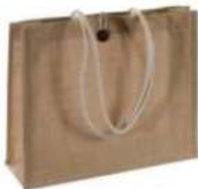
JUTE BAG WITH ROPE HANDLE