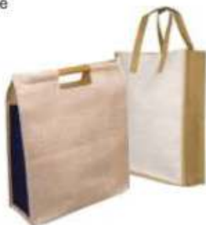
LONG JUTE SHOPPERS

Large 40 w + 15 sides x 40 h Cms. Medium 30 w + 20 sides x 30 h Cms.